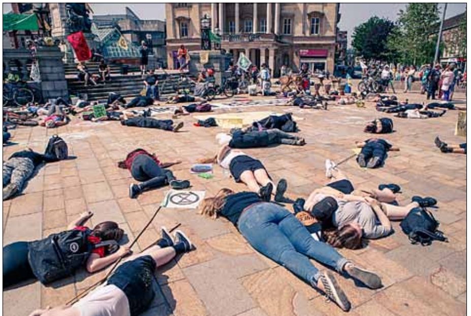
XR die-in, on the steps of City Hall, June 2019